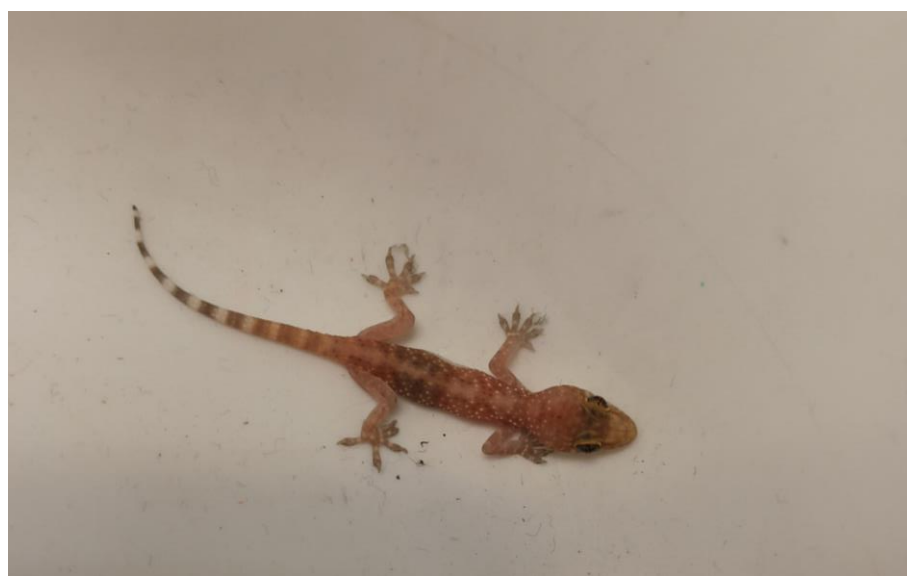
the gecko that inspired “Skittering Saffron”